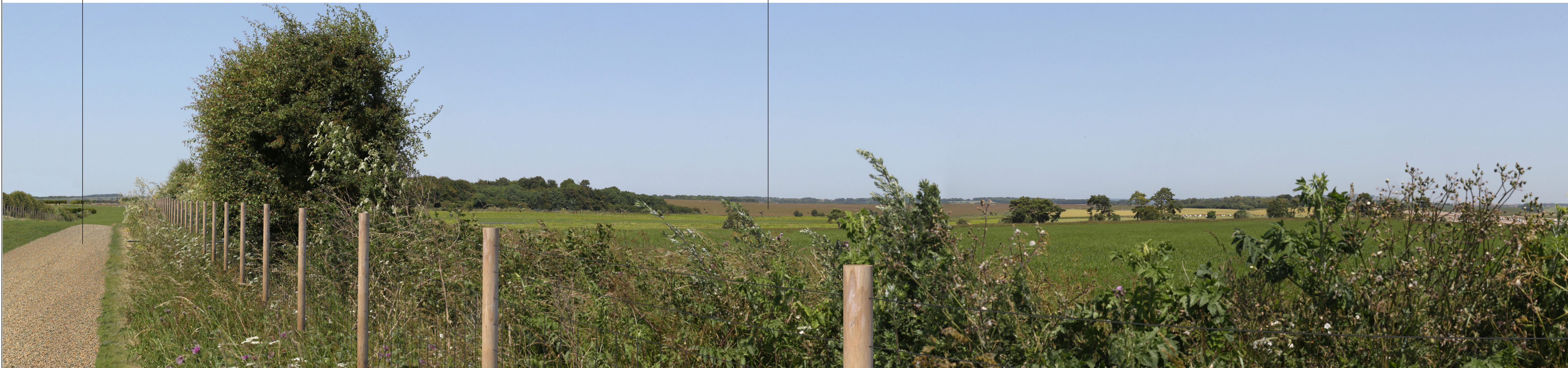
PROPOSED (SUMMER YEAR 15)